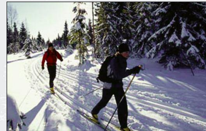
a cross country skiing adventure...

Sylvania, once enjoyed by the rich and famous, is now operated by the U. S. Forest Service as part of the Ottawa National Forest. A 48-unit campground , information and recreation station, pavilion with showers, beach and picnic area and boat landings on Clark, Crooked, and Long Lakes allow you to camp, picnic, hike, or swim and be adjacent to the Sylvania Wilderness.